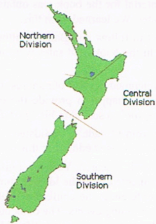
The Masonic 'division' of New Zealand