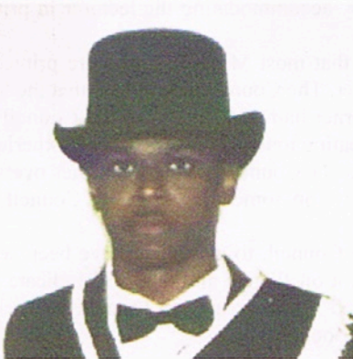
David Gray (2003)